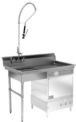
48" Undercounter dishtable with Pre-Rinse