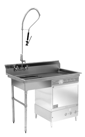
48" Undercounter dishtable with Pre-Rinse