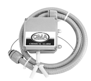
Low Chemical Alarm