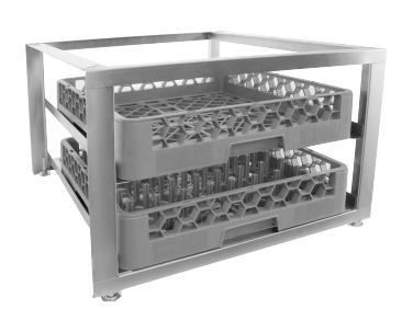
Stainless Steel Pedestal 24"W X 25-3/8"D X 15-1/4"H